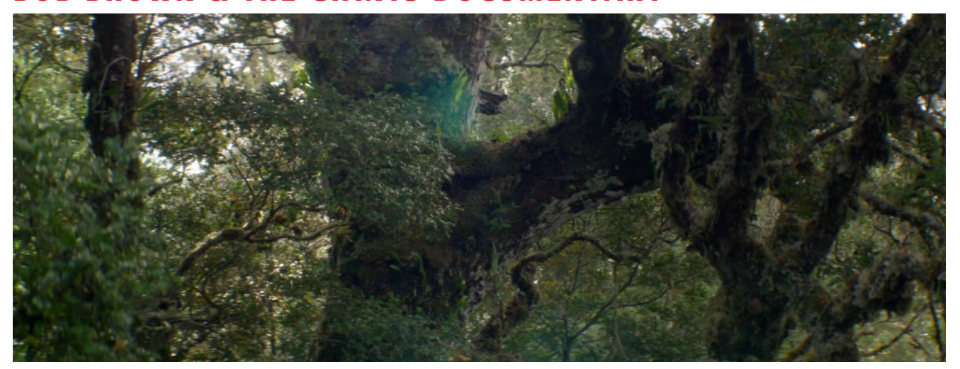
The Tasmanian Myrtle Beech, Tarkine / Takayna. This iconic tree is largely restricted to growing in the Tarkine's cool temperate Gondwanan rainforest.